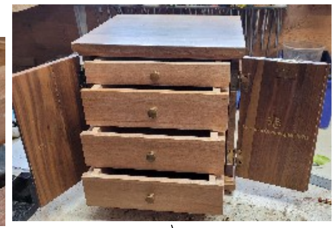
*** OUTREACH ***

The Hackberry Hustlers on their first gig at the Old Train Station.