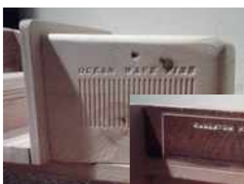
*** TOOLS ***

Next up, a couple of images of the inprogress Ocean Wave Model Firetruck. These show the detail on the Hood and aft box. I might open up the vent a tad but the lettering doesn't look too bad.