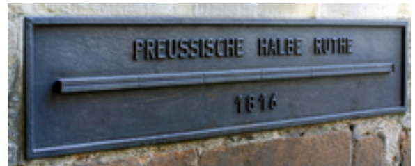
(Munster: Prussuan Half Rod)