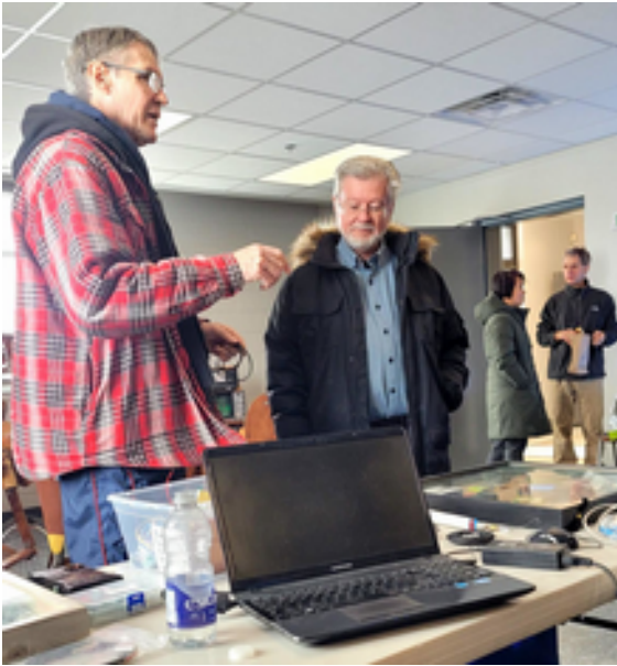
A few more shots from our Raspberry JAM