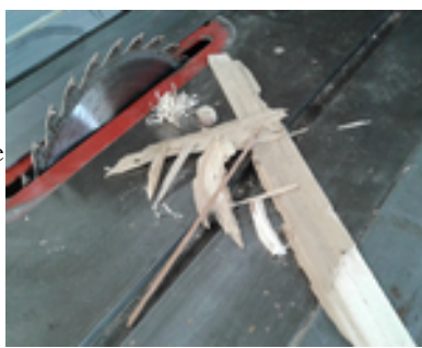
Exhibit-2 shows what made it into the dust collector pipes and bunged up the fan intake. If you have low suction this is a good place to start. The double gate assembly just wiggles off.

Exhibit-1 shows what the table saw grill capture before it could get into the dust collector pipes. This was still a hinderence to be removed.