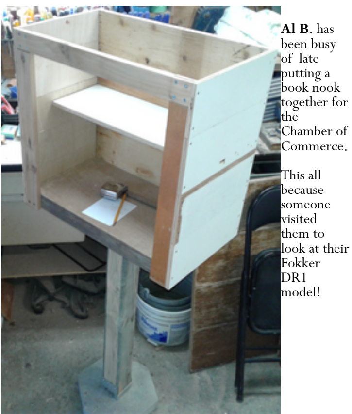
*** FACILITIES ***

Exhibit-1 shows what the table saw grill capture before it could get into the dust collector pipes. This was still a hinderence to be removed.