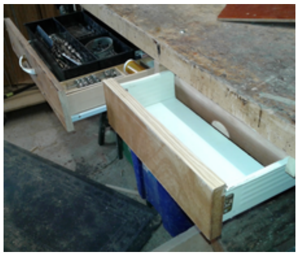
Doug J. Was busy this last week building a second drawer for the central bench. Someone had kindly dropped off a few guide rails and we already had a suitable box. The table top was cleared off, removed and turned upside down for the installation. The front panel support brackets can be installed four different ways! No doubt next time you see inside it will be full of goodies.