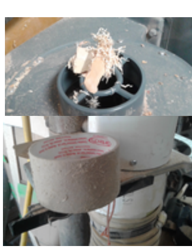
Exhibit-3. Al had trouble closing the table saw dust gate last week. This roll was found INSIDE the pipe?

Exhibit-2 shows what made it into the dust collector pipes and bunged up the fan intake. If you have low suction this is a good place to start. The double gate assembly just wiggles off.