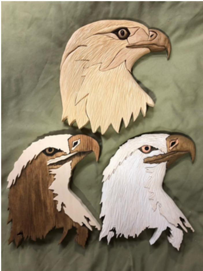
There are two good scroll saws at the shed. If you are looking for a project why not give intarsia a try.