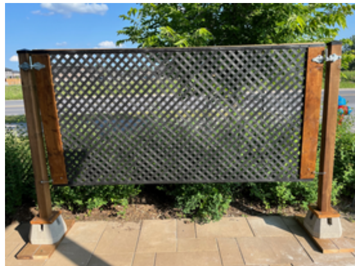
Bill V. Sent a picture picture of the free-standing semi-deconstructible privacy screen he built for their apartment patio. If it doesn't blow down in the wind, he's going to build another. So far so good!