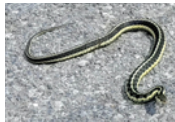
Walking down Carmel in the cool of an evening to find a rabbit on my left, a chipmunk on my right and this little fellow crossing the gravel road.