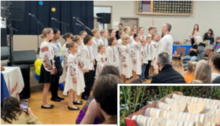
The Ukrainian Childrens Choir performing at their November festival in the Arena.