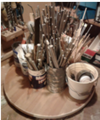
I've installed this lazy Susan on my home work bench. It's cleaned up that end nicely, especially the cans full of steel rods which rather heavy to pull out.