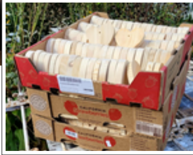
The final tally of 'wooden hearts' many of us helped cut: