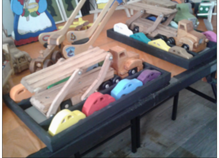
Another photograph of the AB TOY STORE showing the latest truck kits each with eight automobiles to load up. Go count the wheels.

The shades of distance dimly fa'; the mists of evening gather, And hide in hazy, hopeless gloom, Auld Scotia's hills o'heather.