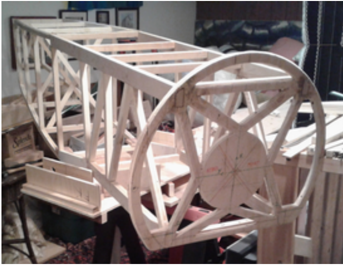
Above is the Fuselage frame recently removed from it's Jig and pending final assembly. This is best man-handled by the horizontal struts as not all of the vertical ones are pegged.