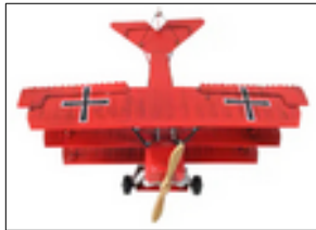
BANDITS 6 O'CLOCK